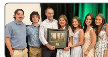
The Ward family

Boyles Tree Farm has been certified in American Tree Farm System (ATFS) for over 50 years. Since 2018, all the pine plantations have been hand-planted with containerized, genetically improved seedlings, as available. They market timber products, hunting leases, pine straw, and real estate. Some stands are enrolled in the carbon market.